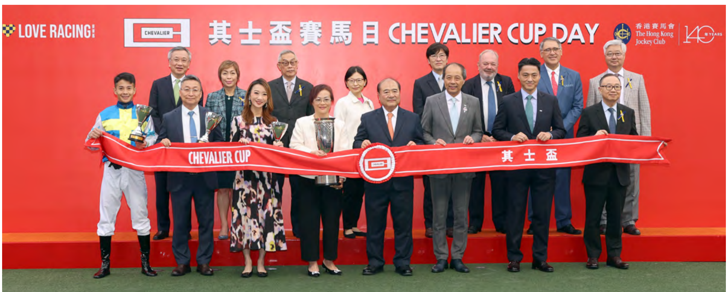
Group photo at the Chevalier Cup presentation ceremony