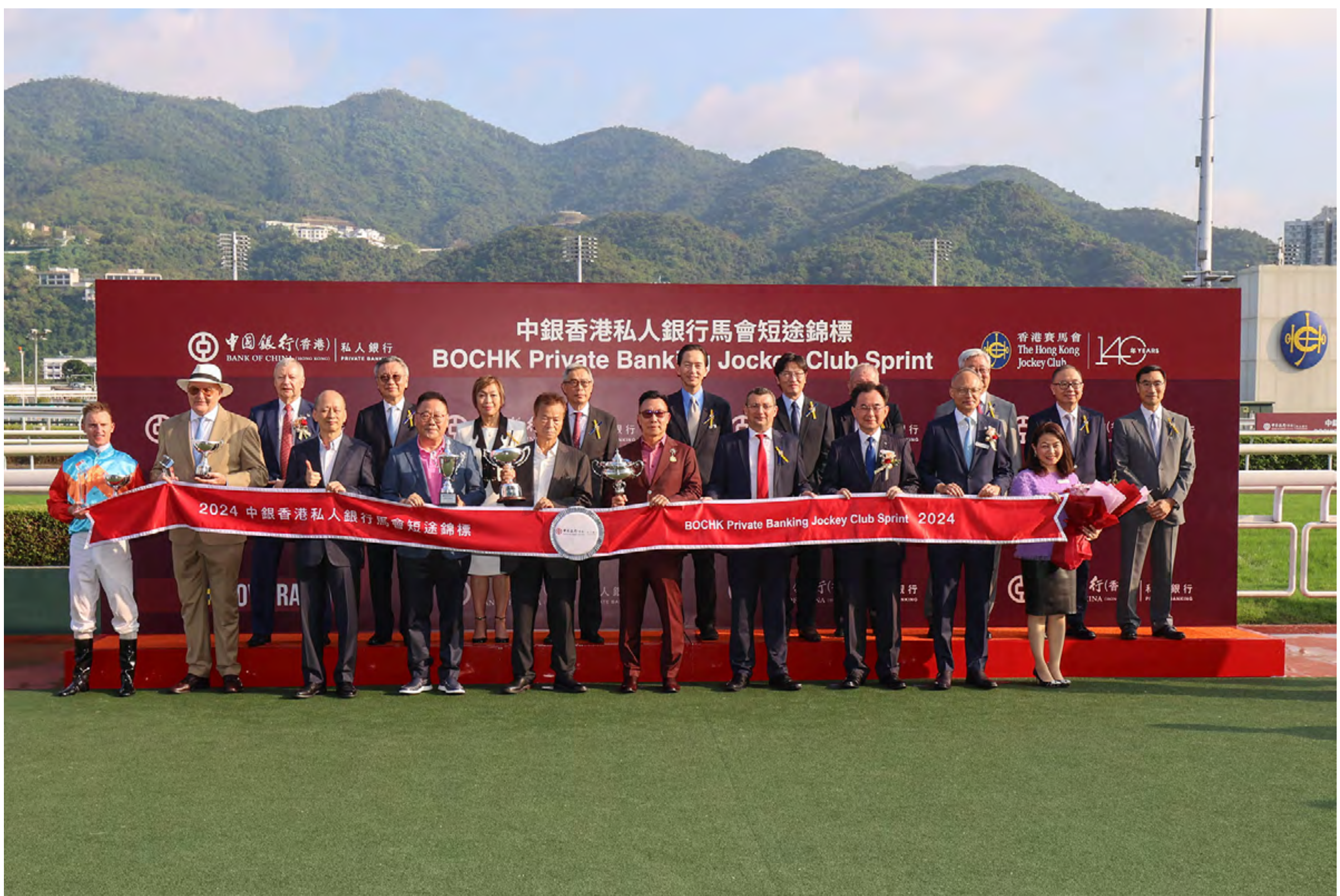
Group photo at the BOCHK Private Banking Jockey Club Sprint presentation ceremony