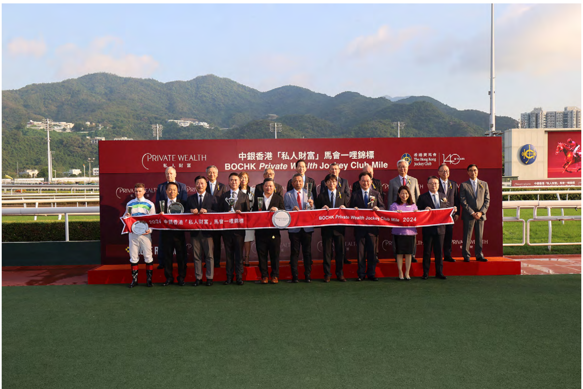
Group photo at the BOCHK Private Wealth Jockey Club Mile presentation ceremony