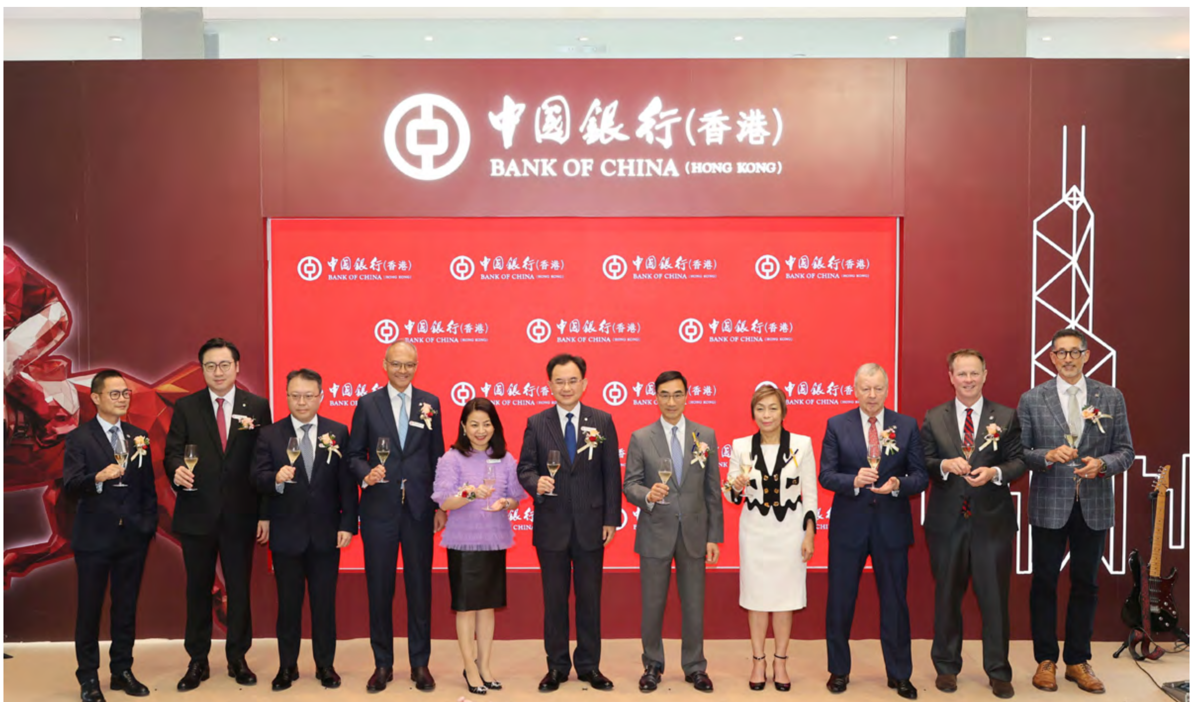
2024 Bank of China (Hong Kong) Race Day Opening Ceremony

Bank of China (Hong Kong) and The Hong Kong Jockey Club presented three Bank of China (Hong Kong) Race Day Group 2 features on 17 November 2024 at Sha Tin Racecourse, showcasing a lineup of elite horses, trainers and jockeys vying for victory with prizemoney of HK$5.35 million per race.