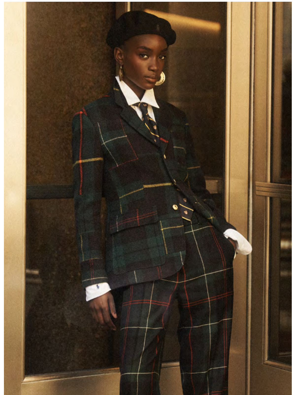
These suits from Ralph Lauren's latest holiday collection can add an air of effortless cool for lady racegoers

Play with bow-themed accessories and bow details: For ladies donning dresses, bow-themed accessories such as chokers, hairpieces, handbags and heels are great for getting into the celebratory spirit. Gowns with bow details, both large and small, add a playful yet elegant flair.