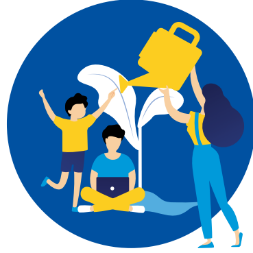
Youth Development & Poverty Alleviation