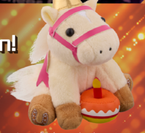
Image is for reference only and may not represent the actual appearance and color.

By using the promo code [VTHNY] to make a reservation for 4 persons or above at Vantage on January 8, 15, or 22, 2025 , each patron attending the reservation will receive a designated shoulder horse plush that clips easily onto your jacket.