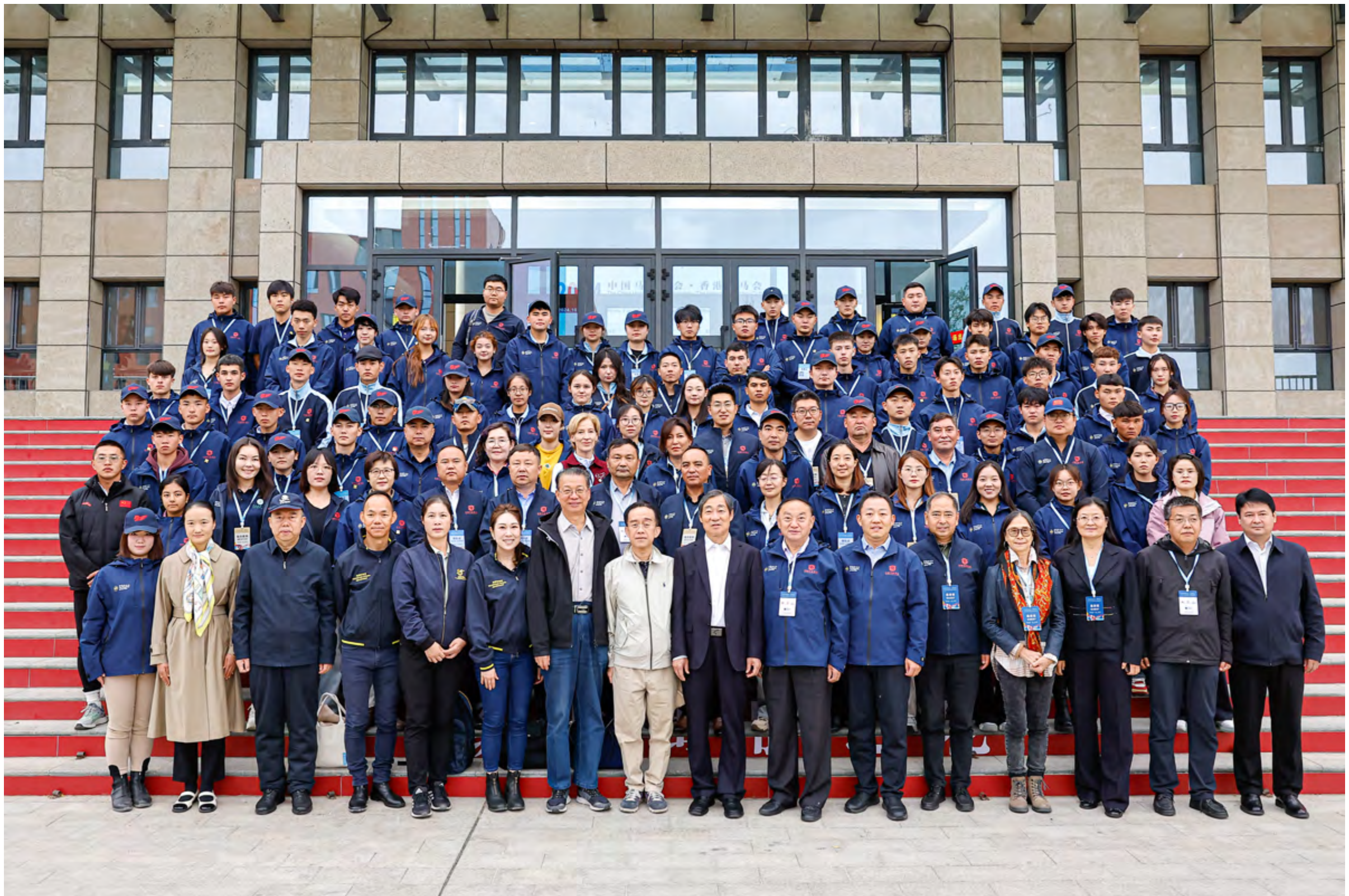
Group photo of the China Horse Industry Association - The Hong Kong Jockey Club Horse Farm Professional Skills Competition for College Students

Since its establishment in 2019, the competition has become a key initiative of the China Horse Industry Association, aimed at providing effective guidance and support for university students training in equestrian vocational skills and education. It evaluates the outcomes of equine education, identifies participants' strengths and weaknesses, and contributes to nurturing internationally minded talent while promoting the growth of the equine industry. In addition, the event featured the "School-Enterprise Connection, Immediate Employment" talent selection initiative, which offered students valuable employment opportunities and fostered deeper cooperation between educational institutions and enterprises, effectively bridging students' career development pathways.