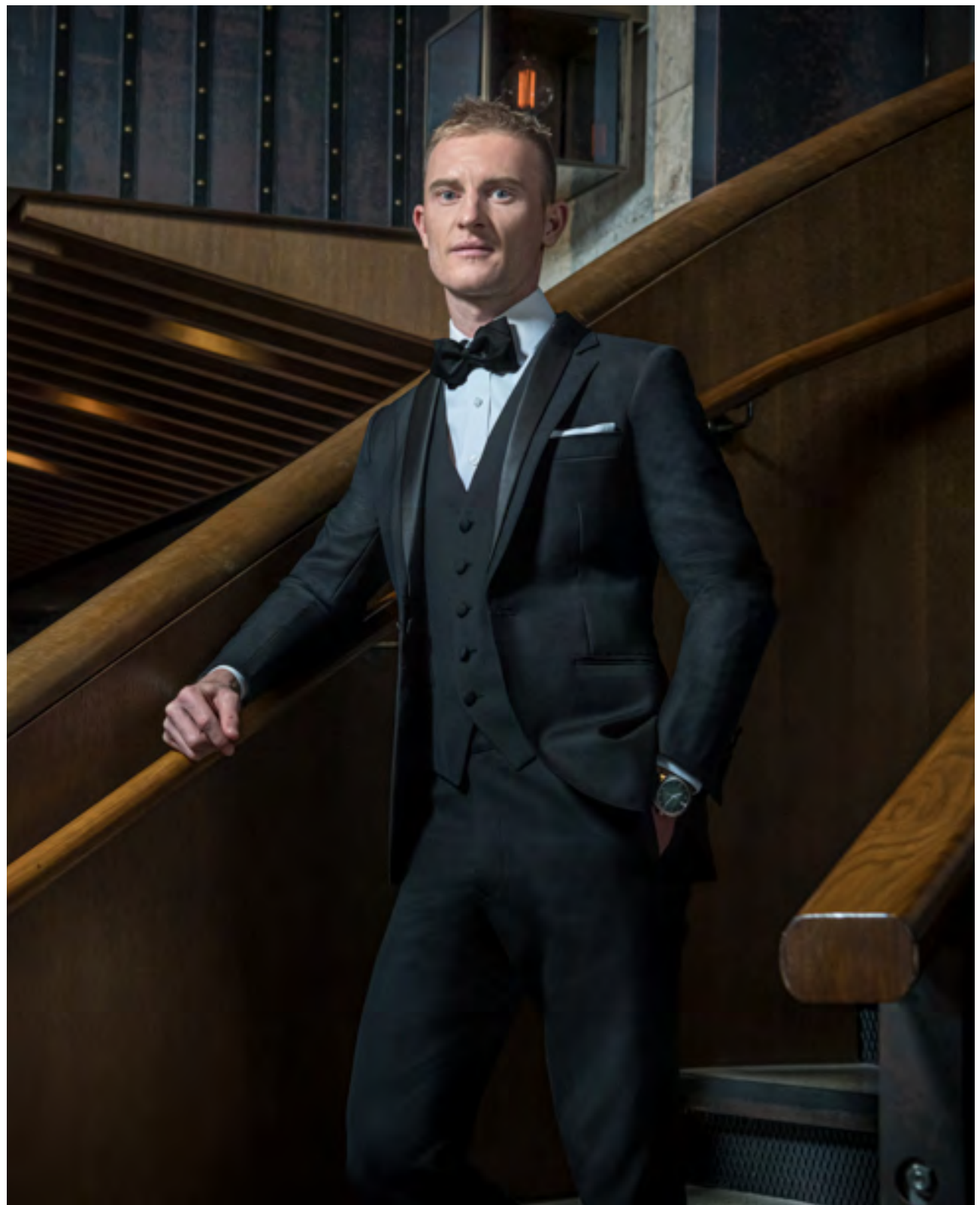
Jockeys donned bow ties to promote 2023's Gentlemen's Bow Tie Raceday

Coinciding with the running of the Group 1 Centenary Sprint Cup (1200m) and the Group 1 Stewards' Cup (1600m) this year, Gentlemen's Raceday is synonymous with style and extravagance – a fusion of excellent racing and fashion.