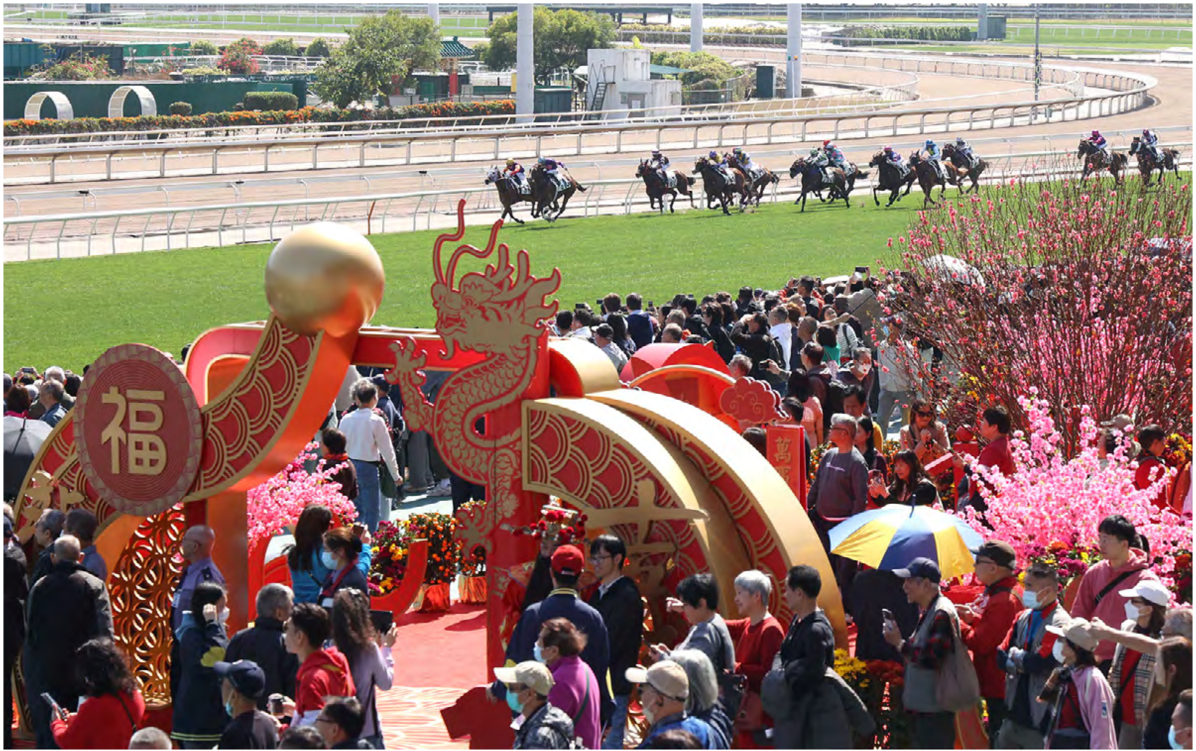
Racegoers flocked to Sha Tin Racecourse for 2024's Chinese New Year Raceday

Always a fabulous occasion laced with vibrant colours, excitement and significance, the Chinese New Year meeting will be held on a Friday and features the first leg of the Four-Year-Old Classic Series with the running of the HK$13 million Hong Kong Classic Mile (1600m).