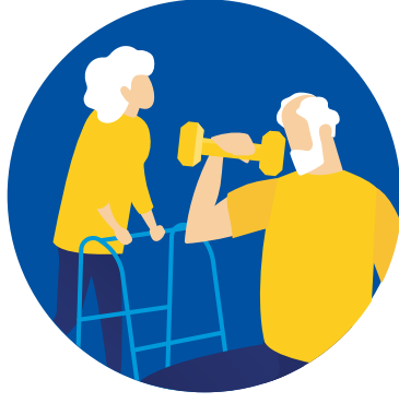
Positive Ageing & Elderly Care

The Hong Kong Jockey Club Charities Trust's strategic focuses cover the following priority areas: