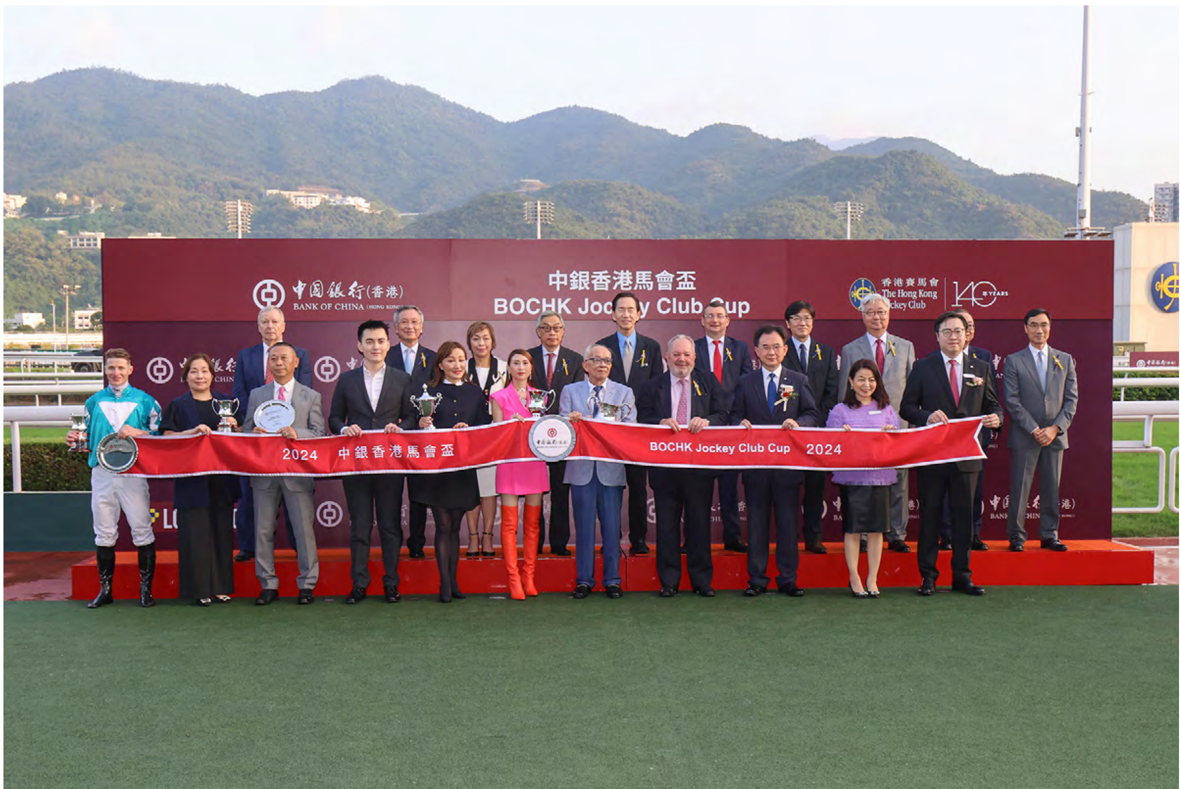
Group photo at the BOCHK Jockey Club Cup presentation ceremony