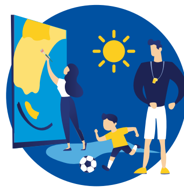
Sports & Culture