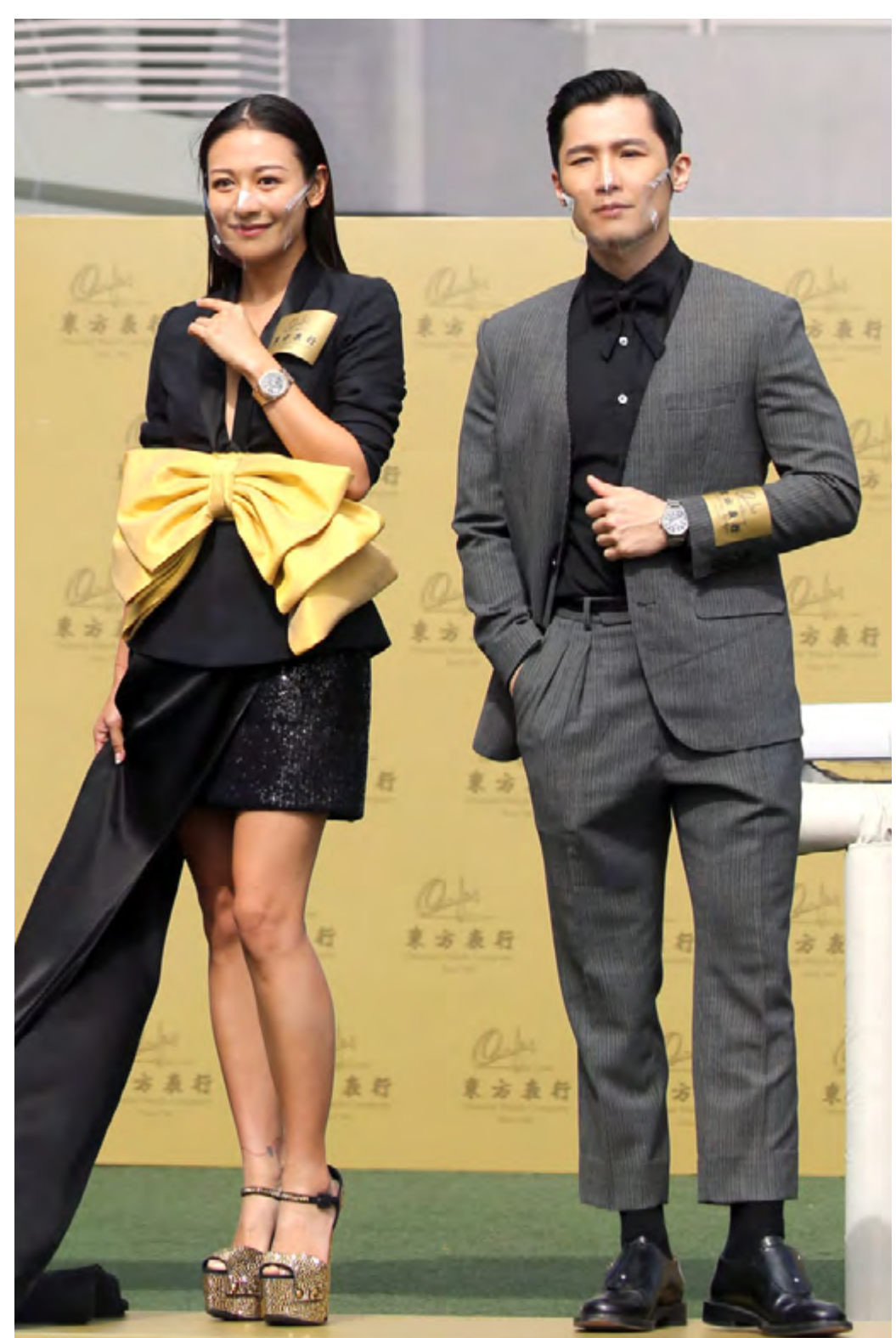
Guests and celebrities showing off their bow-themed outfits in previous Gentlemen's Bow Tie Raceday events