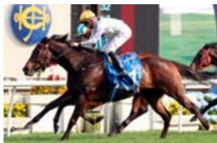
Citi Hong Kong Gold Cup