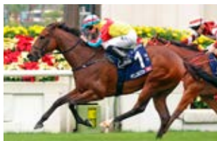
LONGINES Hong Kong Sprint