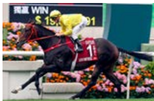
Chairman's Sprint Prize