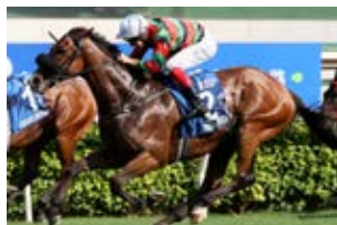
Standard Chartered Champions & Chater Cup