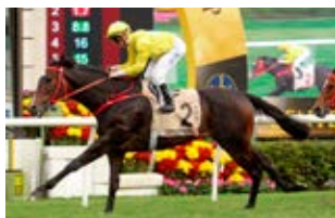
Centenary Sprint Cup