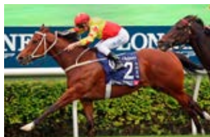
LONGINES Hong Kong Mile