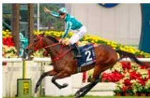
LONGINES Hong Kong Cup