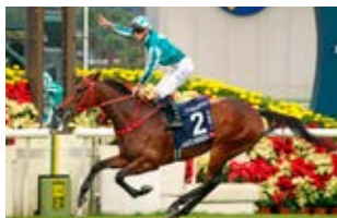
LONGINES Hong Kong Cup