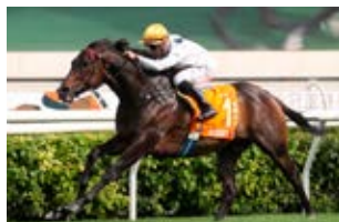
FWD Champions Mile