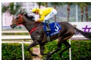
Queen's Silver Jubilee Cup