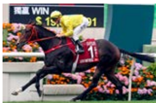
Chairman's Sprint Prize