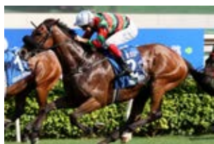
Standard Chartered Champions & Chater Cup