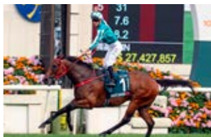
FWD QEII Cup