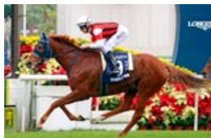
LONGINES Hong Kong Vase