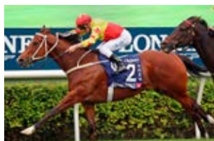
LONGINES Hong Kong Mile